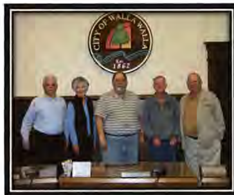
IRRP Citizen Ad Hoc Committee